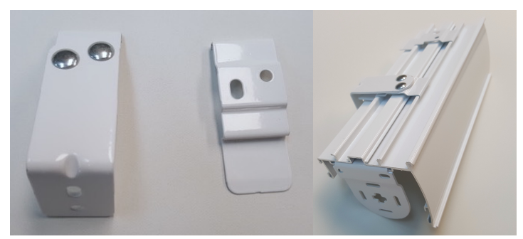
Face fit bracket (L) for fixing pelmet to the wall and top fix bracket (R) for fixing pelmet to the ceiling.